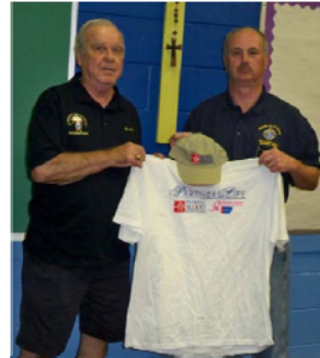
T-Shirts for the Homeless