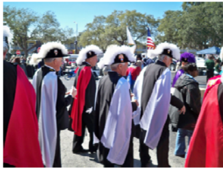
Color Corps during Veteran's Day Parade